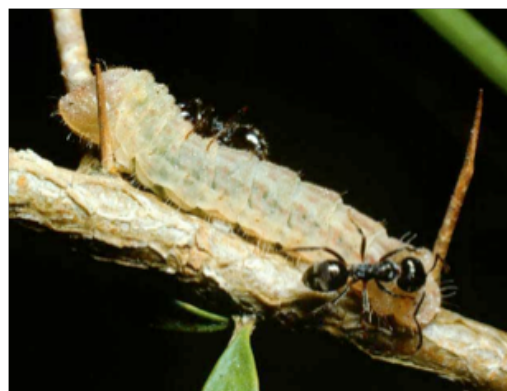
Dull or Eltham Copper Butterfly larvae with ants

http://museum.victoria.com.au/bioinformatics/butter/images/lucilive4.jpg