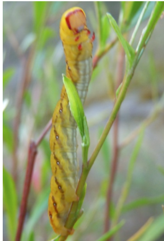
A Molonglo caterpillar taken by Cecilia Melano

10. http://museumvictoria.com.au/discoverycentre/infosheets/marine-fossils/graptolites/