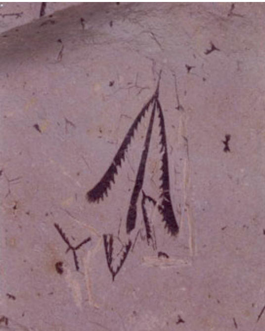
Graptolite, Pendeograptus fruticosus , Early Ordovician (c. 482 my old), Castlemaine district, Victoria 10

A delicious shared picnic rounded out the evening before the mosquitoes became somewhat troublesome.