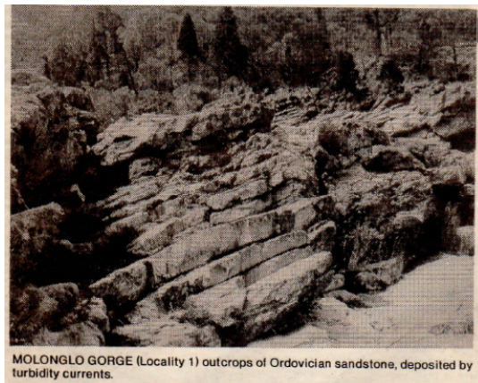
MOLONGLO GORGE (Locality 1) outcrops of Ordovician sandstone, deposited by turbidity currents.

About 2000 to 3000 metres of sediment accumulated in the 20 million years from 460 million years to 440 million years ago. At the end of this interval, however, near the close of the Ordovician, the region was uplifted by earth movements and sediments ceased to reach the local area. Whether the area became land or remained beneath the sea is uncertain. For some 10 million years no sediments were laid down, though elsewhere, in the Snowy Mountains, deepwater sediments continued to be deposited. 2