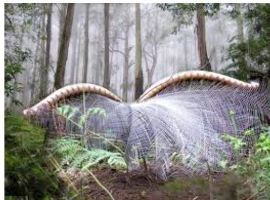
Superb Lyrebird

Listen to one imitate a camera shutter, car alarm, and chainsaw. David Attenborough on http://www.youtube.com/watch?v=VjE0Kdfos4Y