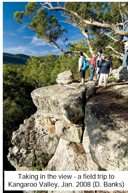
Taking in the view - a field trip to Kangaroo Valley, Jan. 2008

What more could we ask for in our association with the FNAC!