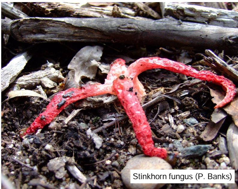
Stinkhorn fungus (P. Banks)

The Australian National Herbarium was formed by the combination of the CSIRO and ANBG collections. It is too big to be held at one location. So the Herbarium at CSIRO holds all the flowering plants (angiosperms) within the broad group of seed producing plants, while the ANBG holds the cryptogams and the gymnosperms, which are seed producing, but non-flowering plants.